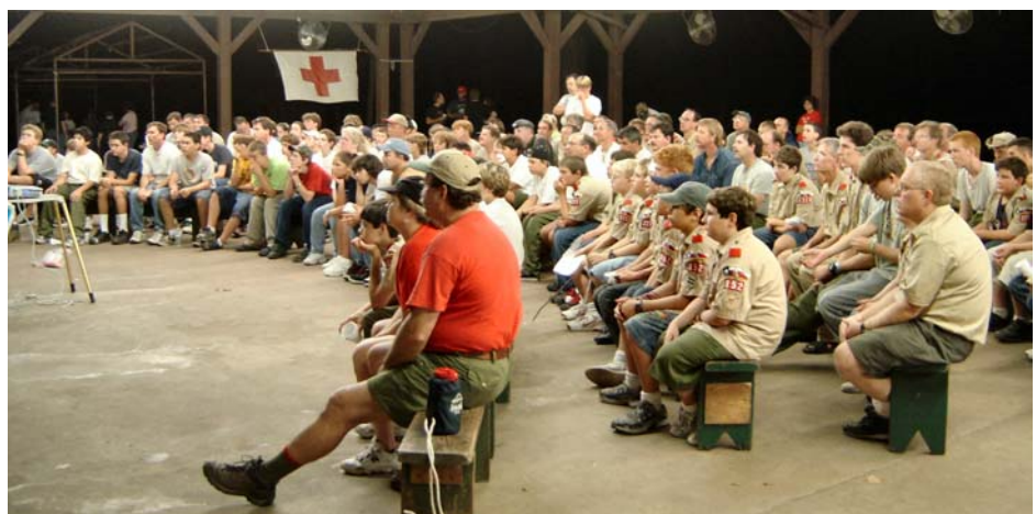
The American Red Cross and the Boy Scouts of America.... Together, We Can Save A Life